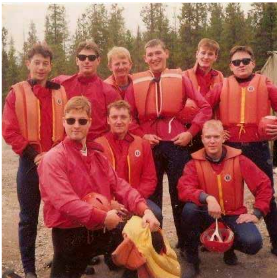
Exercise POND JUMP WEST Sep-Oct 1989, 170 (Imjin) Fd Bty Op & CP JNCOs