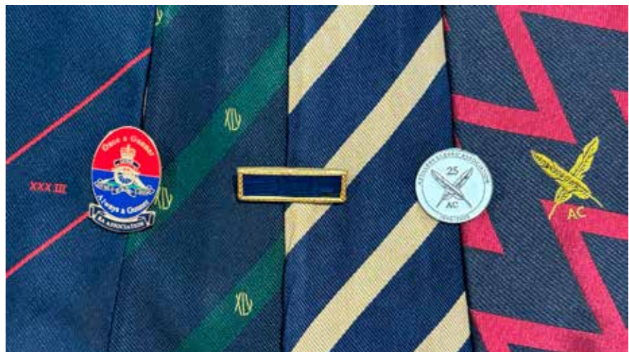
My Artillery life in ties, 33 Bty, 45 Fd Regt, 170 (Imjin) Fd Bty and now.

Gamecock Barracks, Nuneaton and joined Wingate Troop of 33 (Campbell) Battery. After fourth term I was posted to 45 Field Regiment in Haig Barracks, Hohne and served with them until they were placed in suspended animation in 1993. Moving from Hohne to Colchester and then back again to Germany, this time Paderborn. During the time I got married and had a most enjoyable time, filled with Northern Ireland tours, the Gulf War and lots of