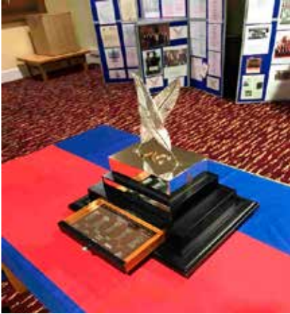
Royal Artillery Warrant Officers' and Sergeants' Mess at Larkhill.