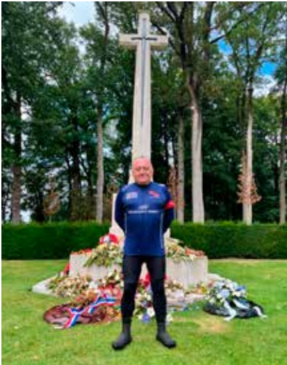
Author September 2022 'The Ride to Arnhem'

Being asked to write a short article for Crossed Quills is a great privilege especially at a time when everyone is feeling the pinch and we all must watch our pennies, the subject of charity is emotive to all and needed by many.