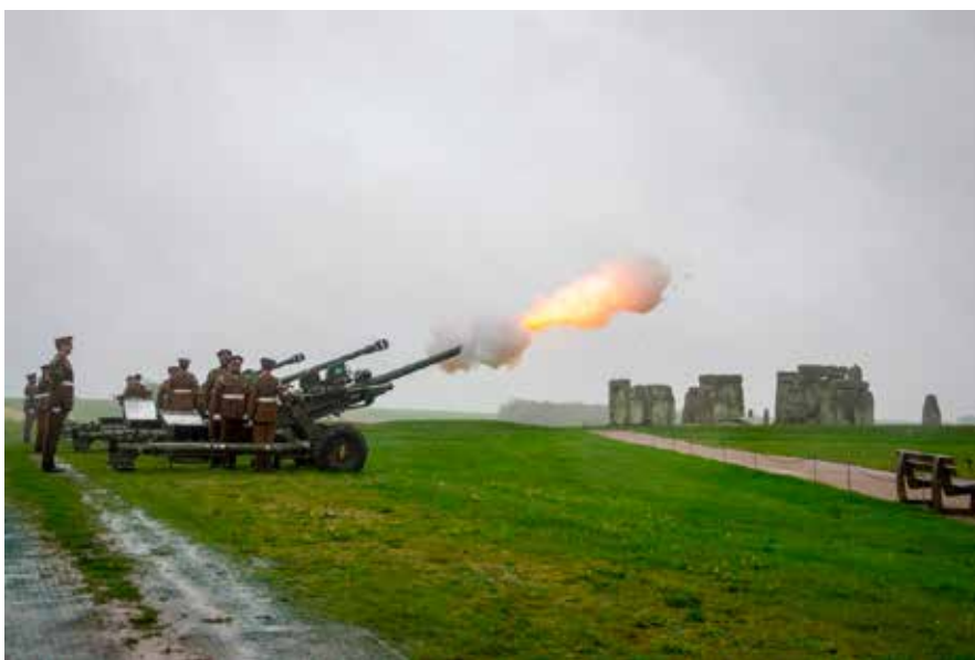
L118 Light Gun fired at Stonehenge to mark the Coronation of His Majesty King Charles III

As is always the case, there have been numerous extra-curricular activities throughout the year with charity events, sporting representation at Regimental level and of course adventure training! Particular highlights include Ex PIPEDOWN – the Regimental ski trip to Les Contamines, France in January that allowed a number of soldiers and officers within the Battery to further their skiing prowess and compete across the Army. Endurance and suffering (chafing) are the words that come to mind when thinking about