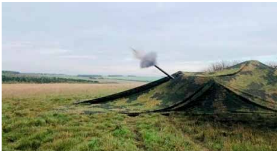
L118 Light Gun deployed under experimentation cam net on Salisbury Plain as part of the ETG