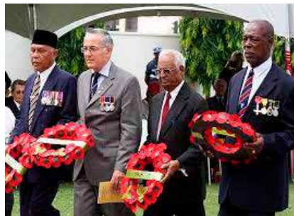
Service or Remembrance - RCEL Conference - Ghana 2008

the Duke had for Malta I was under extreme pressure; however, although nervous I was quietly confident that the simple majority vote needed from the other 52 delegates would go my way. And so it did – four years later, in May 2012, we all assembled in Malta for the Conference based at the Malta Hilton. Unfortunately, the Duke was not able to attend. This was a great shame as it was a most successful conference – still talked about to this day by those who attended. The Hilton, the Malta Tourism Authority, the office of the UK High Commissioner and corporate Malta all did us proud in every respect.