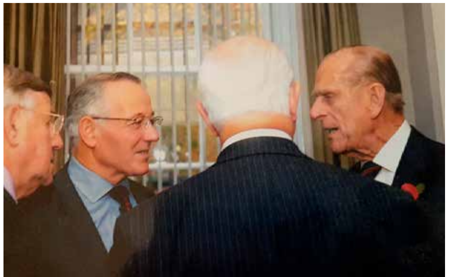
Prince Philip congratulating me on securing Malta as the venue for the 2012 RCEL Conference.

Commonwealth countries contributed greatly during both world wars, providing armed forces personnel and essential materiel. Millions of men and women became casualties, and those fortunate enough to survive returned home to face new realities. Many moved on with their lives, but others continued to suffer from wounds, deteriorating health and abject poverty. The need for assistance was enormous partly because some of their countries considered the care of Commonwealth veterans the responsibility of the United Kingdom. Unfortunately, this kind of thinking left thousands destitute. But the League responded and continues to do so today. It was created in 1921 as the British Empire Services League, but in the late 1950s the charity changed its name to the British Commonwealth Ex-Services League and in 2003, by royal assent, to the Royal Commonwealth Ex-Services League. It has 56 member organizations in 48 Commonwealth countries where today 65,000 eligible veterans are identified.